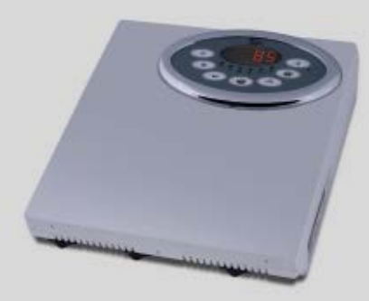
Innova Classic Built-in